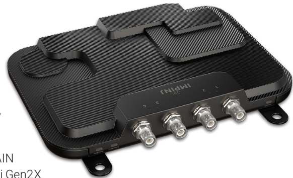
Impinj R700 Series RAIN RFID Reader

Impinj R700 series readers provide best-in-class tag readability, enterprise security, and modern developer tools. IoT developers can easily build and deploy custom enterprise applications with Linux OS, REST API, and native support for industry-standard data formats and protocols such as MQTT. Powerful processing and expansive on-reader memory enable embedded applications that transform RAIN data into actionable business intelligence. With support for the Impinj Gen2X solutions toolbox, the Impinj R700 series advances RAIN RFID performance at dock doors, conveyors, and store exits where items are moving or densely packed. Impinj R700 series readers build on the heritage of the Impinj Speedway reader family, which has been proven reliable since its introduction in 2006.