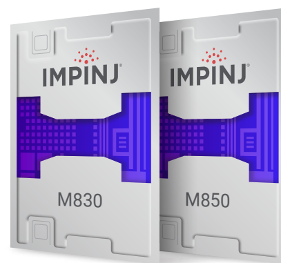
Impinj M830 and M850 tag chips