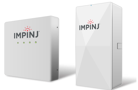
The Impinj xArray and xSpan Gateways

Available in two models—xSpan and xArray—Impinj gateways are fixed infrastructure RAIN RFID reader systems that simplify deployment for applications that need always-on monitoring. Impinj gateways pair an Impinj Speedway reader with purpose-built antennas that monitor tagged items within an environment. Designed for large-scale, item-level applications, Impinj gateways provide real-time item intelligence events.