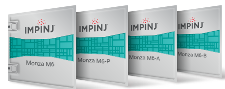
Impinj Monza R6 Series RAIN RFID Tag Chips

Impinj Monza R6 series chips are available in four different versions to support applications from inventory management to airline baggage tracking. Create innovative ways of interacting with consumers using Impinj Monza R6 series chips.